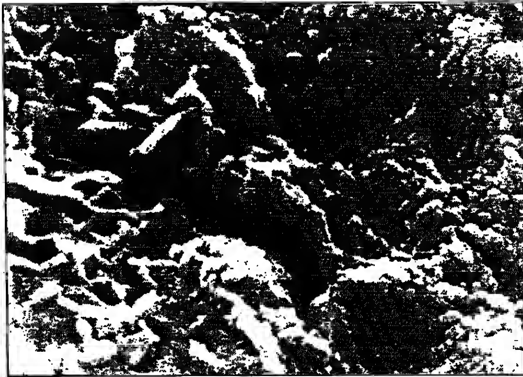
Microscopic Martians: Some theologians say that God could have created them, too.

"Even if they look different from ourselves, He will have a relationship with them as well,"